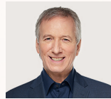
André Lamontagne Ministre de l'Agriculture, des Pêcheries et de l'Alimentation du Québec